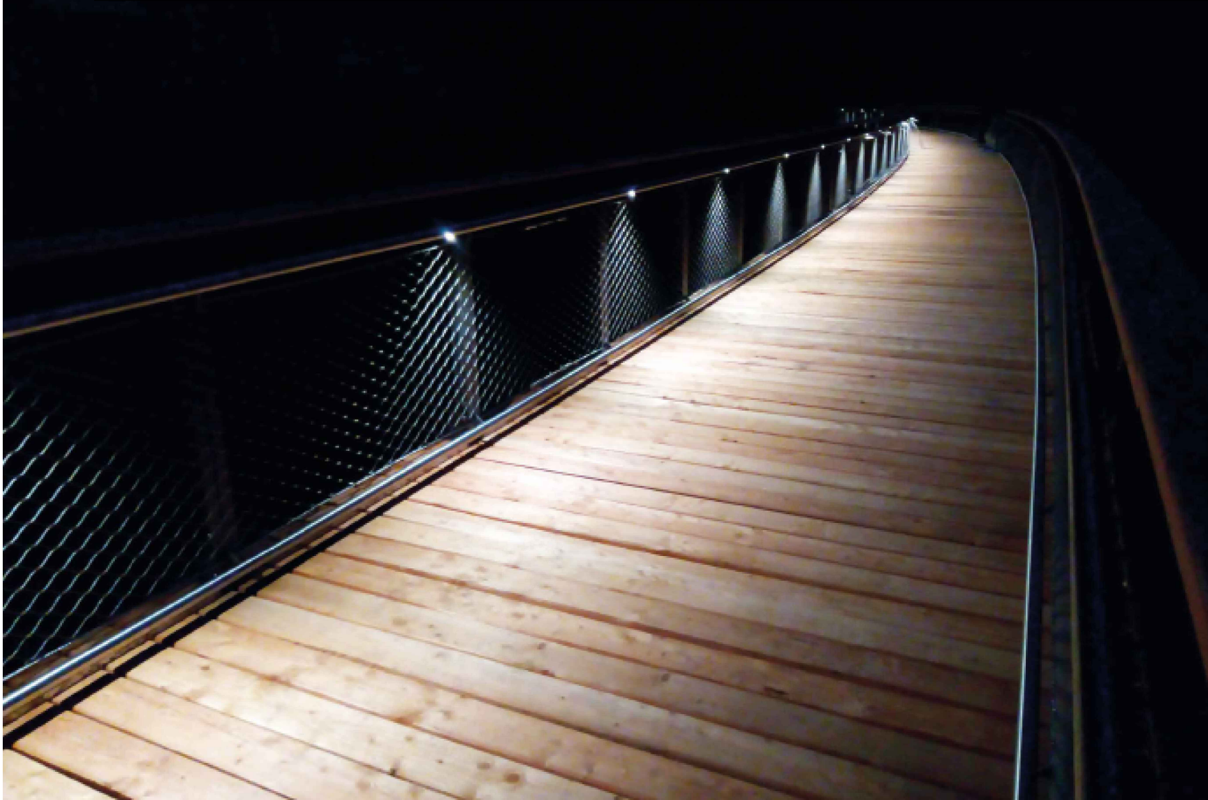
FIG 1: BRIDGE HAND RAIL SAMPLE